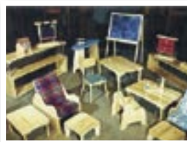
Educational Equipment & Supplies