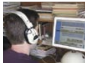
Audio Visual, Computer Training & software