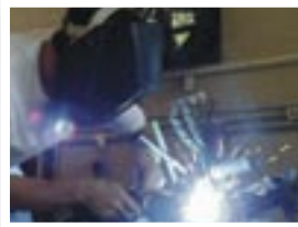
Vocational Education & Training