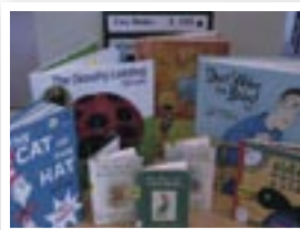
Textbooks & Curricula