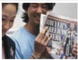
Language Schools & Centers